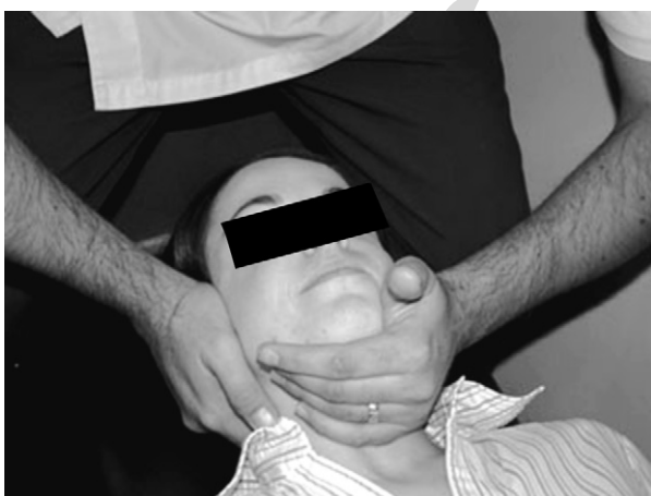
Figure 4 Lateromedial manipulation of the condyle.

Devocht et al., 2003; Gregory, 1993; Hruby, 1985), all of which had positive subjective and objective outcomes. A full spine and TMJ protocol was used in