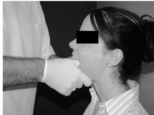
Figure 1 Manipulation of the condyle.

intraorally and thrusting or distracting the mandible anteroinferiorly (see Fig 1).