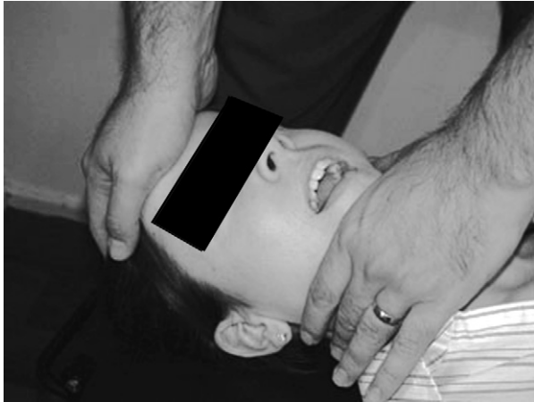
Figure 2 Supine manipulation of the anteriorly displaced disc.